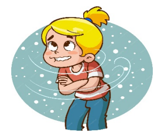
The weather is colder and ALL students <u>must</u> have a coat to go outside for recess. We have limited "rental" coats in the office. As snow falls all students will need the "5 things" – ask your student about those 😊

Dec 6 – Winter Concert, 1<sup>st</sup> & 3<sup>rd</sup> Grades Dec 8 – Angel Tree Gifts Due at PLE Office Dec 21 – End of 1<sup>st</sup> Semester Dec 22 – Winter Break Begins-NO SCHOOL Jan 8 – Classes Resume Jan 15 – MLK Day – NO SCHOOL